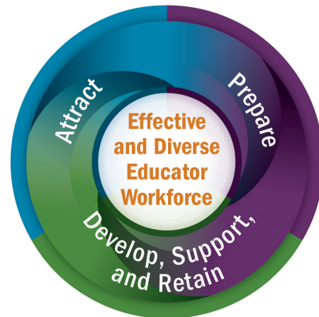
Exhibit 1. The GTL Center’s Talent Development Framework